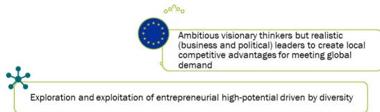
Figure 1. Core elements of smart specialisation